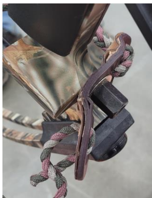
This style bolt is permitted.