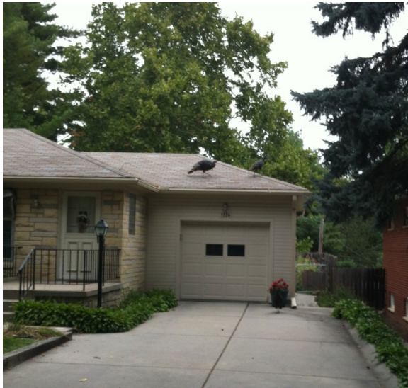
Figure 3. A wild turkey on a roof in the middle of a medium-sized city.

Turkeys are not known to damage structures. Their roosting, however, may result in soiling of structures by their excrement (Figure 3). On occasion, turkeys have pecked vehicles, causing damage to paint and even breaking side view mirrors.