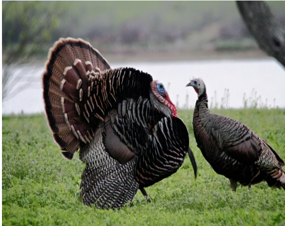
Figure 1. Male turkey ( Melagris gallopavo ) making a mating display to the female (Left).

Prepared by the National Wildlife Control Training Program . http://WildlifeControlTraining.com Research-based, certified wildlife control training programs to solve human – wildlife conflicts. One source for training, animal handling and control methods, and wildlife species information.