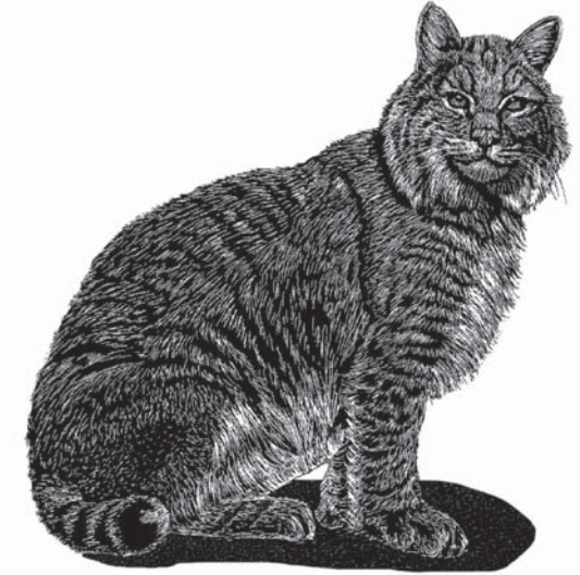
Bobcat ( Lynx rufus )

SC Department of Natural Resources Wildlife & Freshwater Fisheries Division Furbearer Project Wildlife Section