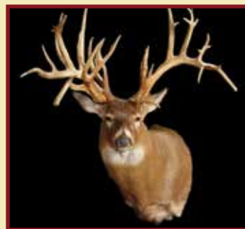
Worlds Outstanding Whitetails display with Jeff Eades