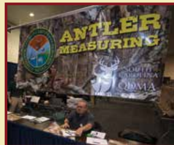
SCDNR Deer Rack Scoring