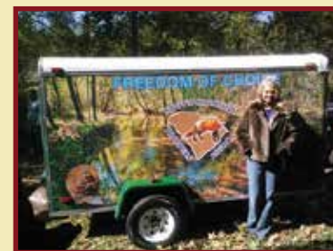
Coyote Trapping by the SC Trappers Association