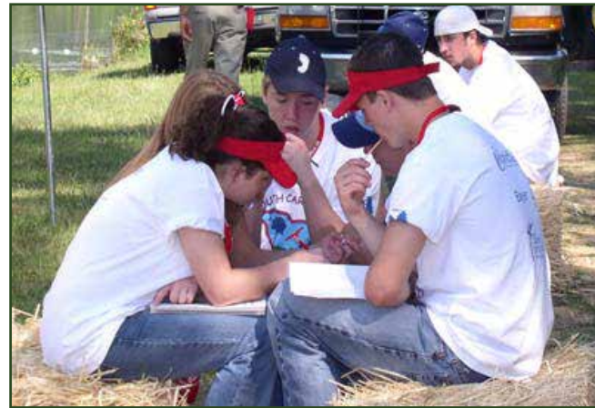
A team of students work together to complete the forestry test.

The winning team goes on to represent South Carolina at the North American Envirothon which is hosted by a different state or Canadian Province each year.