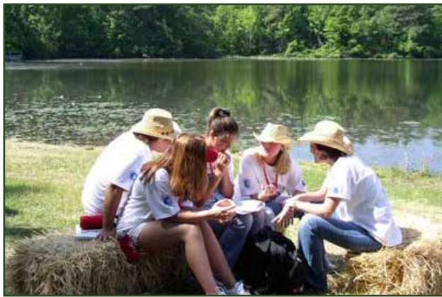
Teams have the opportunity to get "up close and personal" with South Carolina's natural resources.

The 2018 Envirothon Coaches' Workshop is scheduled for Saturday, 2/3/18 at Clemson Sandhill R&EC, Columbia. The 2018 SC Envirothon Competition will be held on Friday, 4/20/18 at Sandhill. For information email: phillipsd@dnr.sc.gov .