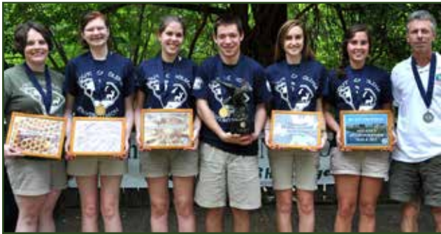
The first-place team in the state goes on to the Envirothon's North American competition.

The South Carolina Envirothon is an annual hands-on environmental problem-solving competition for high school students. Participating teams compete for recognition and scholarships by demonstrating their knowledge of environmental science and natural resource management. The Envirothon competition tests the student's knowledge on topics such as soils, aquatics, forestry, wildlife and current environmental issues.