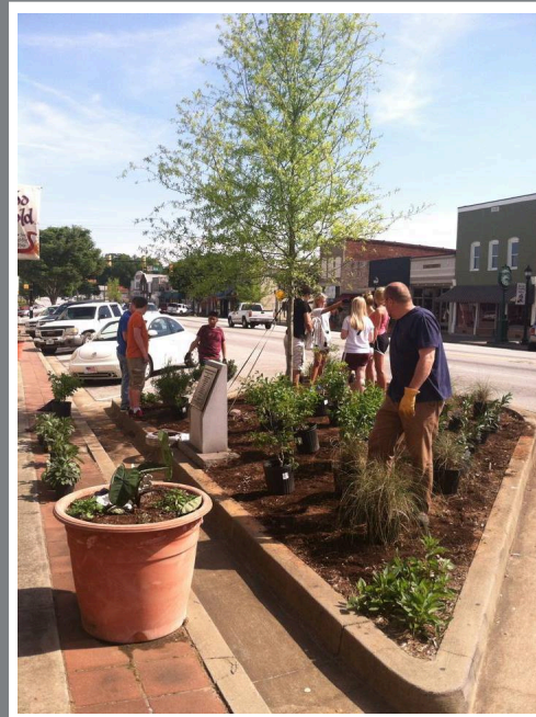
Below: Woodruff High School's Science Club working to complete the Water Wise Garden Project

The Soil & Water Conservation District and the Woodruff Roebuck Water District sponsored the raingarden project located on Main Street in Woodruff, SC. This included water-wise gardening methods and a permanent sign displaying a map of surrounding businesses, events, and information about the garden.