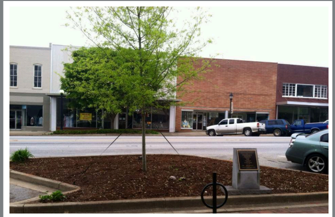
Above: Island on Main Street in Woodruff, SC before the Water Wise Garden Project