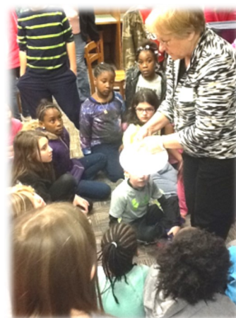
Students at York Road Elementary learned about worm anatomy and worm behavior.

Worms are all the rage for school groups and garden clubs & the Conservation District has supplied worms and workshops for several this year. Worms eat fruit and vegetable scraps, reducing the amount of garbage you throw away. And the castings worms make from the scraps are a nutritious addition to your garden, reducing your need for chemical fertilizers. For more information on how to make and maintain a worm composting bin, contact your Conservation District.