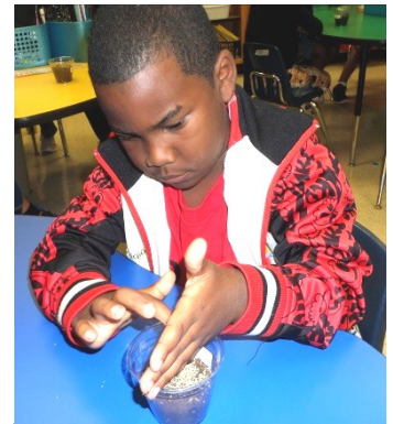
A student learns about germination by planting grass seeds.

The 8-lesson garden series is in progress for first graders at St. Anne School, Northside Elementary and Richmond Drive Elementary in Rock Hill and Hunter Street Elementary in York.