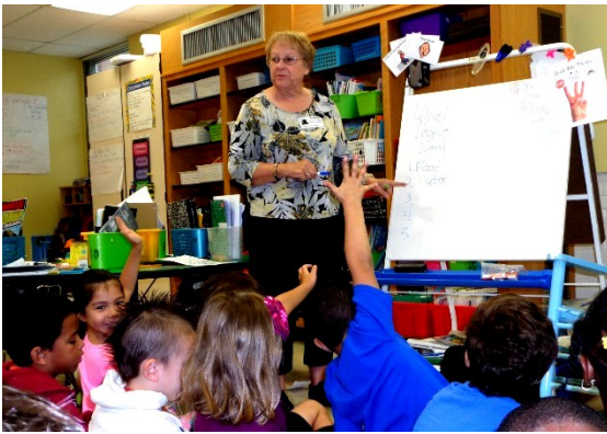
First graders learn about what plants need to grow during September's lesson.

The Conservation District's school garden program is in its 5th year and has helped start a raised bed vegetable garden with 74 classrooms of first graders at 20 elementary schools in York County. Ensuring that these schools can keep their garden program going is a major mission of the District . . .and we appreciate the many volunteers who help with this program.