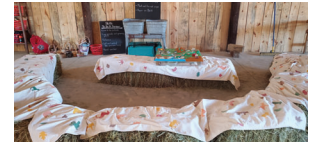
YSWCD presented the Enviroscape weekly for the 2nd year at Curtin Farms in Clover for their "Down on the Farm" Summer Camp.