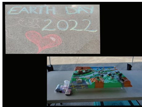
We presented the Enviroscape at Earth Day 2022 held at the York County Material Recovery Facility.