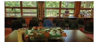
Bethelwoods (a local summer camp) asked YSWCD to come weekly and present the Enviroscape to campers.