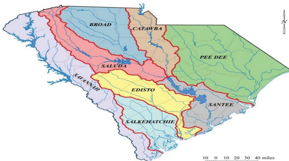
Figure 1. The eight surface-water basins to be modeled in South Carolina.