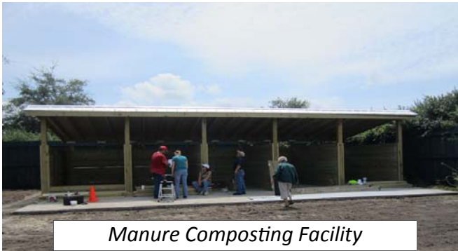
Manure Composting Facility