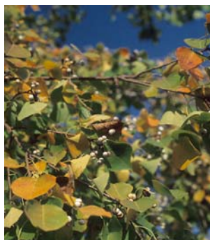
Brush Management of Invasive Chinese Tallow or popcorn tree

The following BMP's were installed voluntarily by landowners with financial assistance from NRCS and Beaufort SWCD.