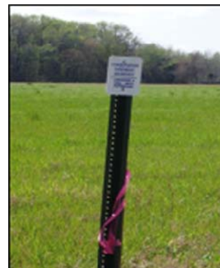
FRPP easement boundary sign

NRCS and Beaufort Conservation District have requested $1.5 million to protect 387 acres of prime farmland under the Farm & Ranchland Protection Program to protect the land from future development.