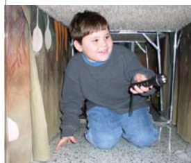
Exploring "underground" in the Soil Tunnel.

ACE Basin Alive! is a program designed by the Conservation District to teach upper elementary and middle school students about the importance of the ACE Basin. This program was funded through a youth education grant from Lowcountry R C & D. (Resource Conservation & Development). Above, students examine baby horse crab molts. Other topics included alligators, snakes, SC Furs, Sea Turtles, Wetlands, & marine litter. Presenters came from Friends of Hunting Island, Parris Island Natural Resources, Clemson Extension, and SC DNR. All students & teachers received an ACE's Activity Book developed by SC DNR NERR.