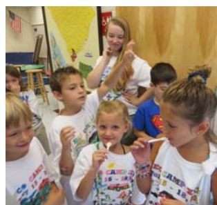
Students learned about bee keeping & processing honey. The best part was tasting the honey!

Look for information coming out on our 25th Eco Camp this spring, 2014.