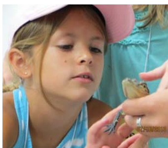
Students got to observe & touch a baby alligator.

Observe, Explore, Experiment, Create, & Discover at Eco Camp