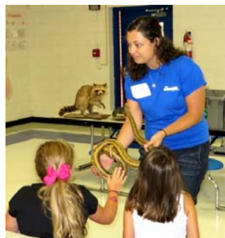
Cool snakes from Lowcountry Institute.