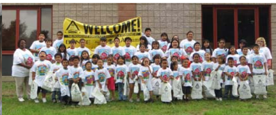
2013 Progressive Agriculture Safety Day

Mission: Help people conserve, maintain, and improve our natural resources and environment by promoting wise land use practices, environmental education and technical assistance.