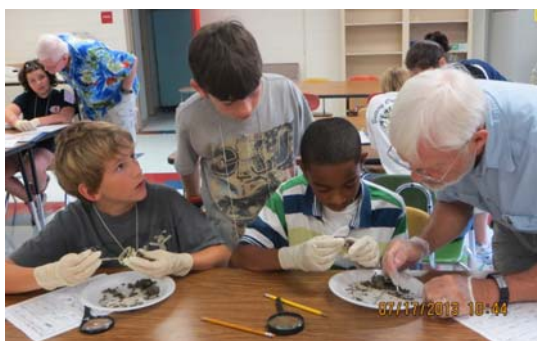
Students dissecting Owl Pellets work on identifying the bones of the owls' prey.