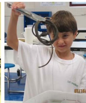
To learn the different ways birds hunt, this "bird" caught a snake (rubber) to eat.

Beaufort Conservation District continues to deliver excellent environmental science programs to area children and adults. Over 8500 children & adults came to 323 programs and festival outreach. The district offers over 20 environmental science programs as well as leading Project Wet and Wild activities. A strong emphasis is placed on water quality programs, which include the Enviroscape Model, Groundwater Model, and the ever popular Soil Tunnel. A variety of other science programs and activities can be seen at our website at http://www.beaufortconservationdistrict.org/ .