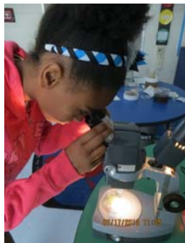
Students examined mosquitoes under the microscope.