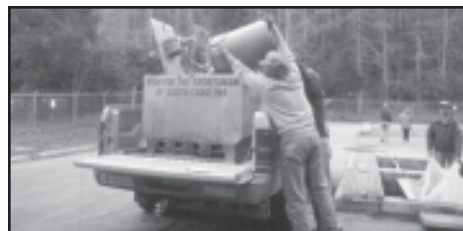
Trout being loaded on a fish distribution truck for stocking in local trout waters

Number of Raceways: Twenty-two raceways for raising fish, one raceway for display trout, one raceway for brood stock. Approximately 400,000 trout are stocked annually.