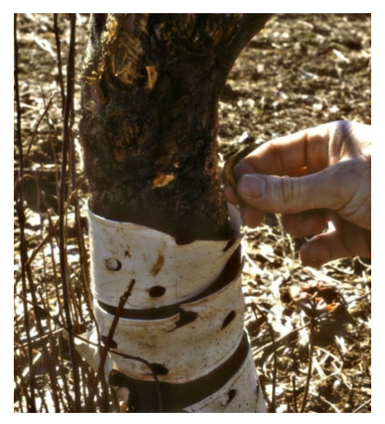
Figure 4. Damage to a fruit tree by woodchucks.

Woodchucks are often a major problem for home gardeners. They can cause significant damage to crops such as beans, lettuce, peas, carrots, cabbage, clover, and plantain. Trees may be severely damaged or killed by chewing and territorial marking (Figure 4). Woodchucks may strip apples or cherries from trees in the vicinity of dens. Woodchucks readily climb fruit trees, causing damage to limbs and fruit. Broken limbs of fruit trees can be mistaken for damage by raccoons.