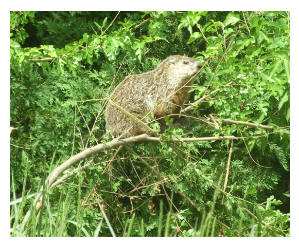
Figure 1. Woodchuck ( Marmota monax ) in a tree.

Prepared by the National Wildlife Control Training Program. <a href="http://wildlifeControlTraining.com">http://wildlifeControlTraining.com</a> Research-based, certified wildlife control training programs to solve human – wildlife conflicts. One source for training, animal handling and control methods, and wildlife species information.