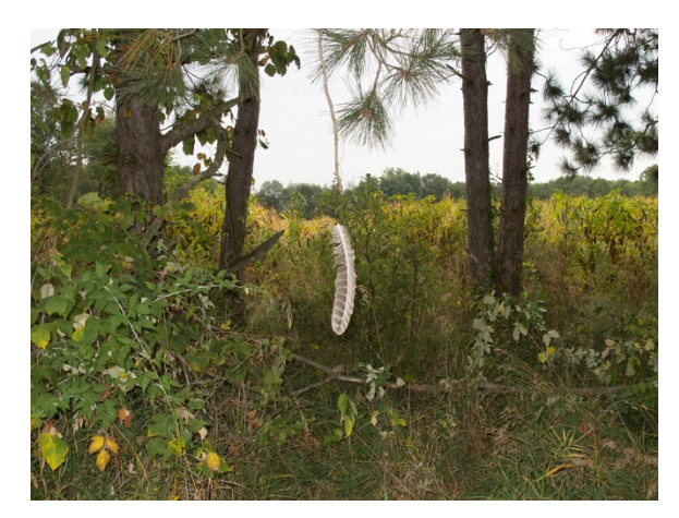
Figure 4. Feathers suspended on a line with a fishing swivel will spin in the wind and attract the attention of bobcats.

Bobcats often hunt by sight, so using a visual attractant can be effective. A flag set uses a piece of fur or a couple of feathers suspended about 4 feet above ground with fine wire or string. Bobcats can be drawn to traps by "flags" hung from trees or rocks located near trap sets (Figure 4). Where use of animal parts is prohibited, use aluminum foil, CD-ROMs, or imitation fur or feathers.