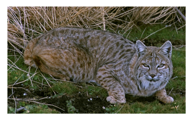
Figure 1. Bobcat ( Lynx rufus ).

Prepared by the National Wildlife Control Training Program. <a href="http://wildlifeControlTraining.com">http://wildlifeControlTraining.com</a> Research-based, certified wildlife control training programs to solve human – wildlife conflicts. One source for training, animal handling and control methods, and wildlife species information.