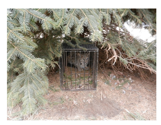
Figure 5. Bobcat caught in a cage trap.

Location is the key to trapping bobcats. If the location is not correct, flags or baits will not work. Set traps in the vicinity of depredations, travel ways to and from cover, or hunting sites. Cover the bottom of the cage trap with soil.